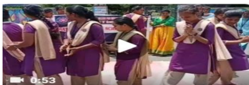
A bit of visuals from the street play by our students 13:07