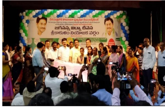
Students receiving VidyaDeeena Scholarship from Shri. Dharmana Prasad Rao garu, Revenue Minister

Description: In GDC Srikakulam (A) a Program was Organized by the Department of Politics on Vidya dheevana Scholarship.Scholarships are of great importance to all of the Studentswho are not able topaytheirfees because of the financial burden on their families. The JaganannaVidyaDeeena Scheme launched by The Government of AP is a Boon for all the Students. Shri.DharmanaPrasad Rao Garu, The HonorableMinister of Revenue Department, Government of AP gave away the VidyadheevanaScholarships to the beneficiaries. We take this wonderful opportunity to Thank our Honorable Cheif Minister Shri. Jagan Mohan Reddy garufor Implementing such a wonderful Scheme for the welfare of the students. We also Thank our Our Honorable Minister Shri. Dharmana Prasad Rao for giving away the Scholarships for the Beneficiaries.