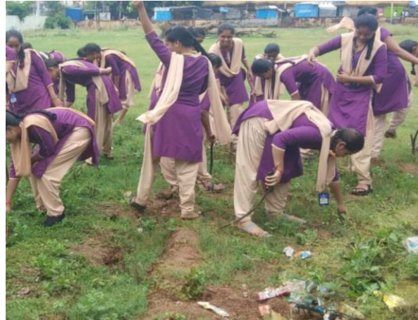
Campus cleaning drive by the Students