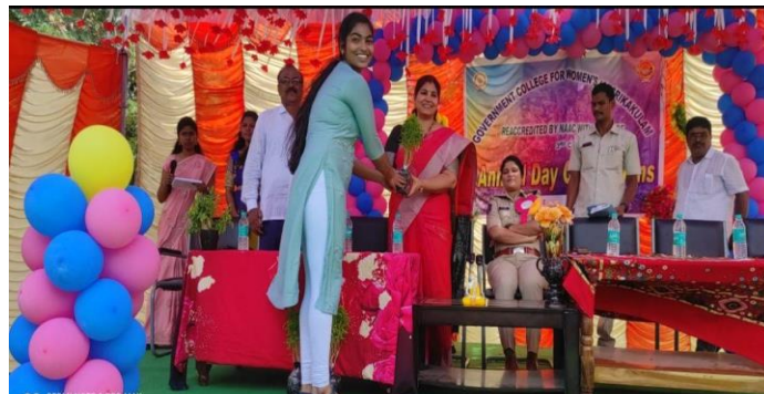
Welcoming the Cheif guests