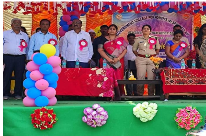
Prayer by the Students